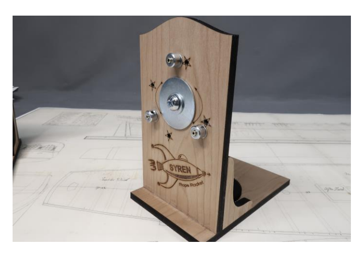
On the inside of the head stock, place the remaining large washer onto the machine screw. See photo below.

Next, use one large washer and a smaller ¼" washer while slipping the remaining machine screw through the bearing hole. Do this from the etched side of the head stock. See the photo on the top of the next column.