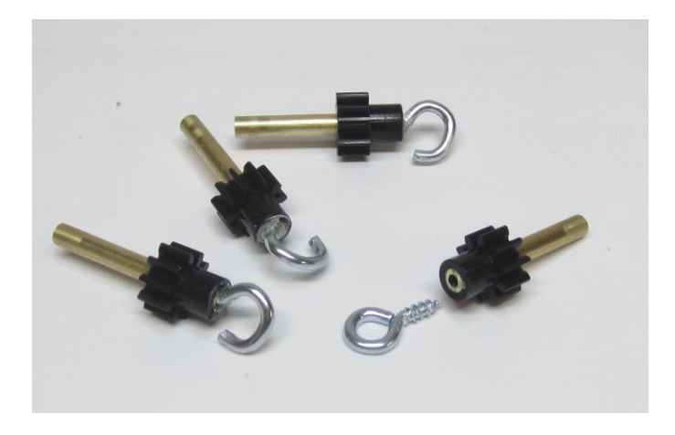
table top. The gently tap the brass tube into the bore of the larger gear side.

Then you will need to insert the open eye screws into the bore (actually the brass tube). See above. Now sometimes the eye screws will screw into the brass tubes rather easily. But if the wont screw into the tubes easily you will need to file down the diameter of each of the threaded screws just a hair to make that happen. Its not a big deal actually. But either way, you will need to secure the eyes into the brass tubes with some glue. Preferably a two part epoxy. It really need to be secure and the eye screws shouldn't spin within the brass tubes at all when the glue dries.