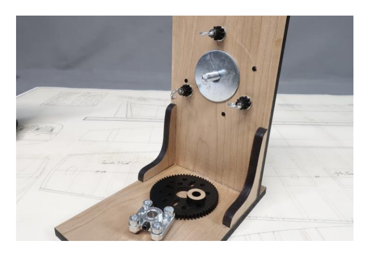
Also have the large gear at the ready along with the wooden washer/spacer. You can have the aluminum hub ready as well with the four set screws installed.