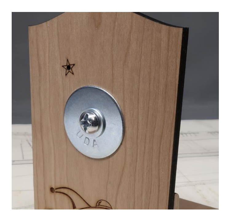
Turning your attention to the inside of the tail stock, place the remaining large washer over the machine screw. See below.

Insert the large machine screw into the center hole with the ball bearing. But also first slip on one large washer and the smaller washer as shown below.