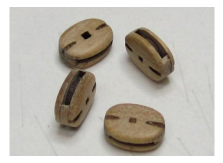
NOTE: You can purchase the Model shipways block tumbler here at

http://www.modelexpoonline.com/product.asp?ITEMNO=MS27